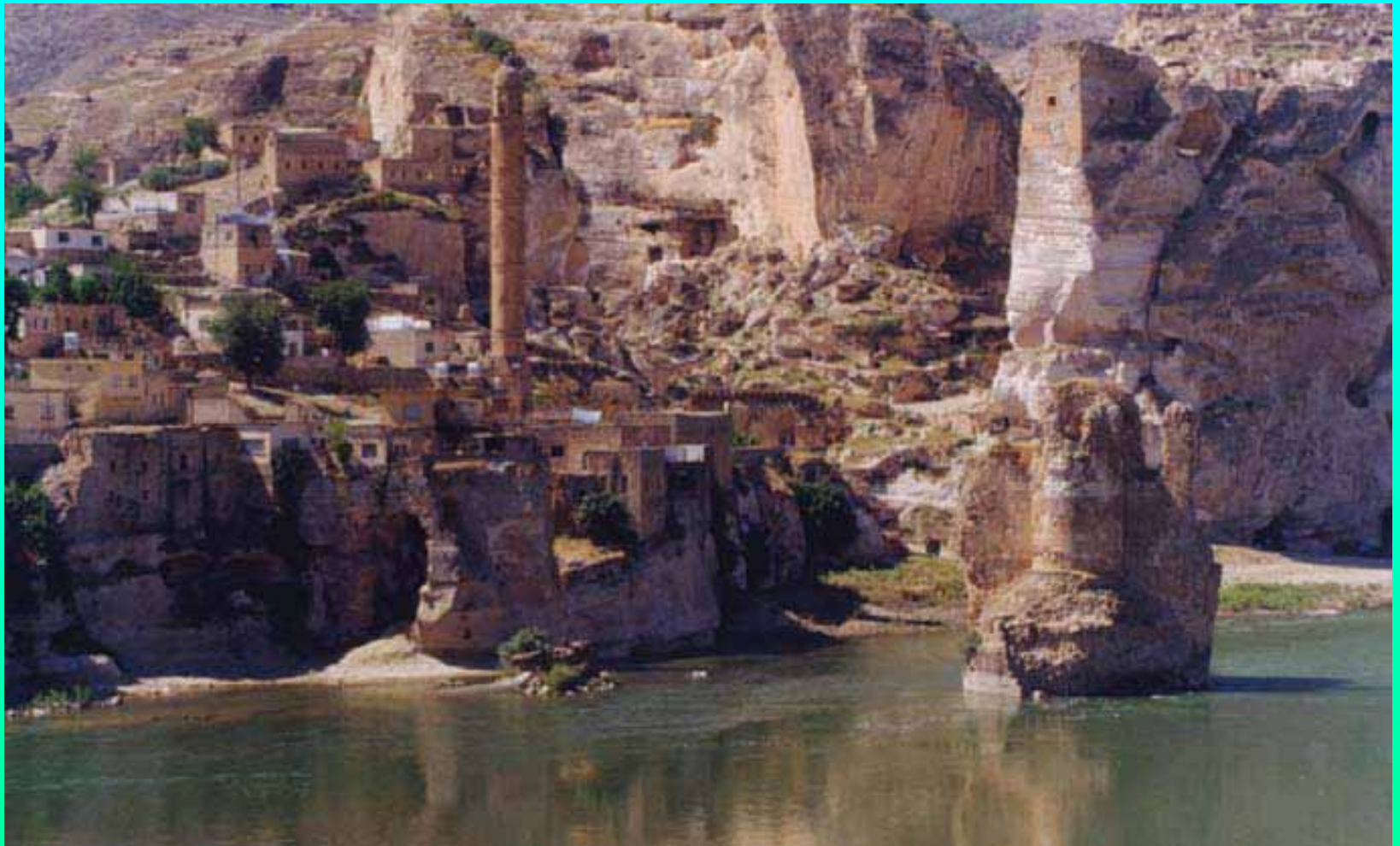
Hasankeyf, Turkey – this historical city will be submerged if the Ilisu dam is built.