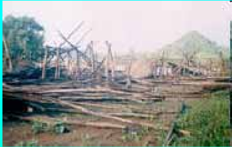
Debris of adivasi houses destroyed by police in village Chimalkhedhi