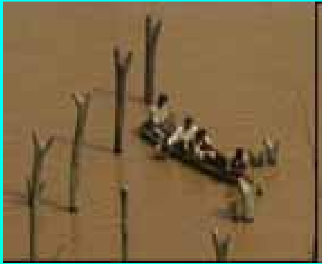
Wooden pillars of submerged home in village Bharad Dist Nandurbar, Maharashtra